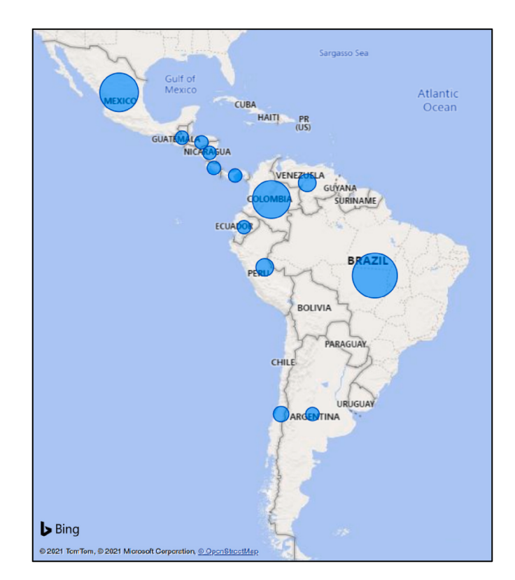
Fig. 1. Participating countries.

The second group - outreach and research - clustered initiatives related to the interaction of the HEIs with their stakeholders and SD-